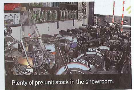
Plenty of pre unit stock in the showroom.

Despite residing on one of the Capital's busiest thoroughfares, the South Circular Road, you cannot miss the pre unit Triumph enthusiast's Mecca, Ace Classics.