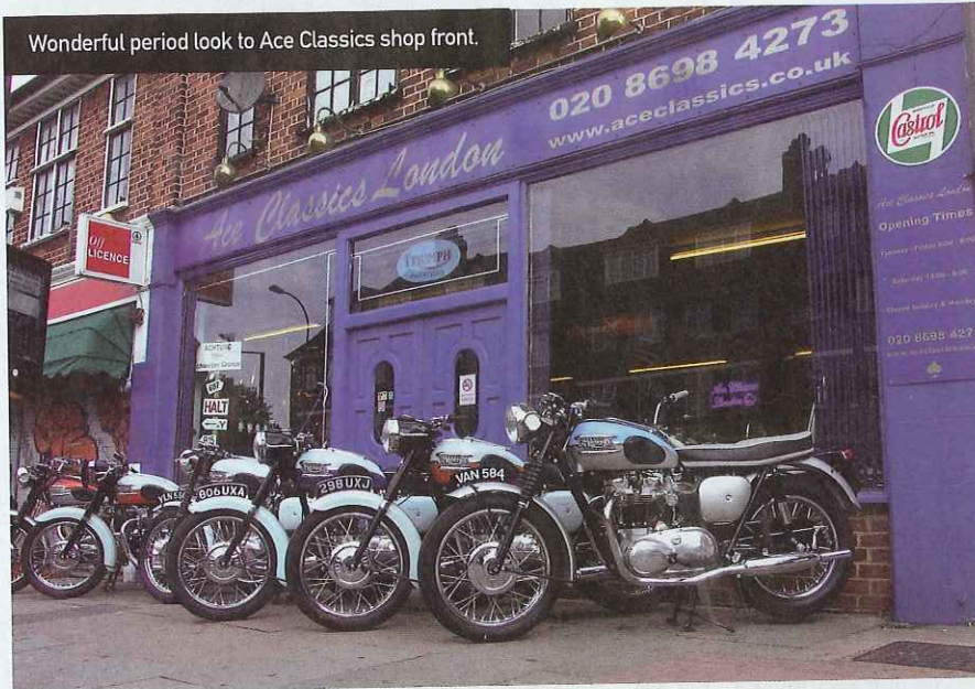
Wonderful period look to Ace Classics shop front.