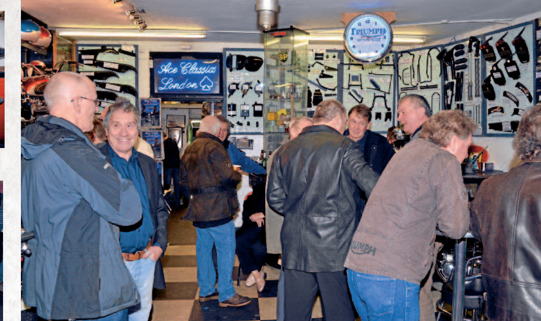
The 'old' shop has guests congregating.

The new building is to be more of a showroom, allowing additional machines