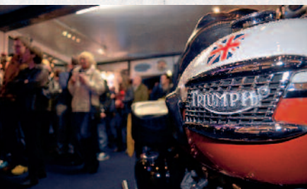
The ISDT Triumph's tank badge - it was