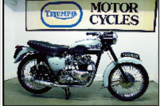
1969 T120 BONNEYELLE painled in the late 1959 Colours Azure Blue & Pearl Grey this bike is mint.